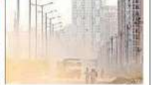
Exposure to construction dust affects breathing and respiratory systems and damages lung tissues.

The station was not functional on Sunday. The data recorded was inconsistent and outdated. The station was not functional on Sunday.