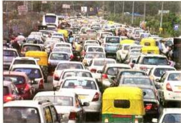
■ Traffic police official claim that the number of vehicles older than 15 years plying on the roads are very less